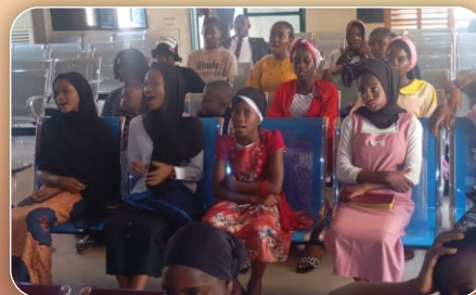
AFCE FUDMA CAMPUS