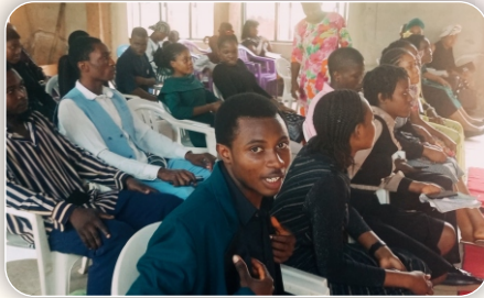
AFCE UNN WELCOME PROGRAMME