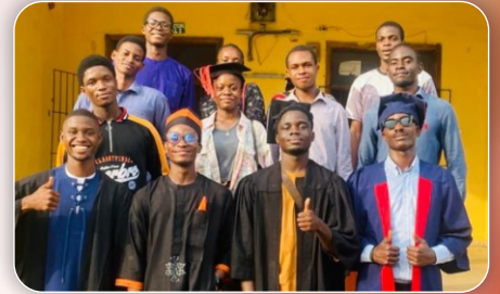
AFCE FUTO CAMPUS