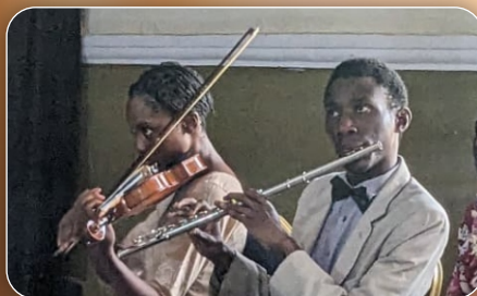
AFCE UNILORIN CAMPUS