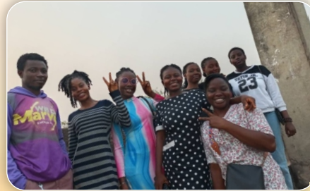
AFCE UNN CAMPUS