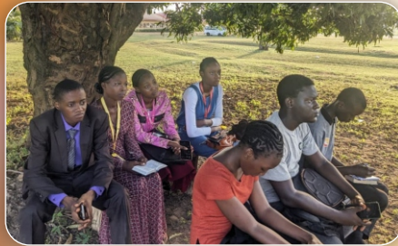
AFCE UNILORIN CAMPUS