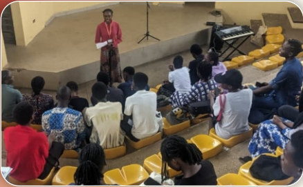
AFCE UNILORIN CAMPUS