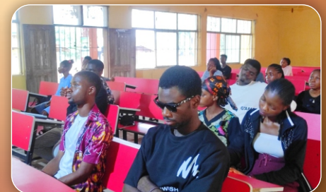
AFCE FUTO CAMPUS