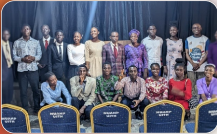
AFCE UNILORIN CAMPUS