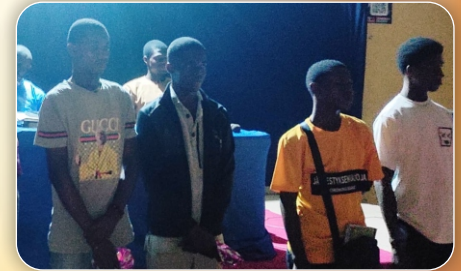
AFCE FUTO CAMPUS