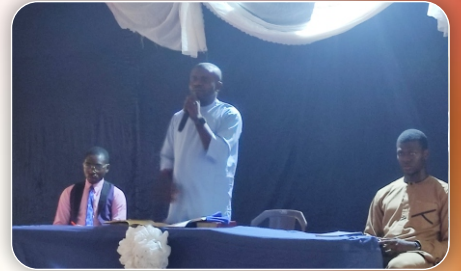
AFCE FUTO CAMPUS