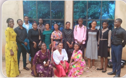
AFCE UNN WELCOME PROGRAMME